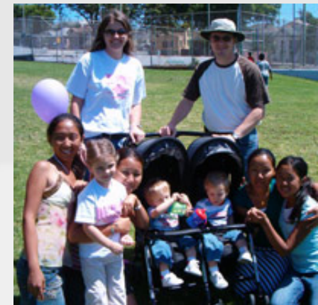
Volunteers and youth at picnic.

RT and several other members of the East Bay Refugee Forum held a refugee awareness event/picnic at San Antonio Park in Oakland on August 11. This celebration was a success, with over 70 attendees enjoying Vietnamese barbeque, Bosnian burik, and Liberian specialties, in addition to at least ten other gourmet dishes from around the world. Several students enrolled in the summer Newcomer's School received yearbooks from the OUSD and had a great time playing badminton, tug of war, and soccer.